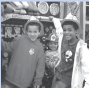
Children inspect gauges of a Springfield Fire Department truck during the FSC Grand Opening.