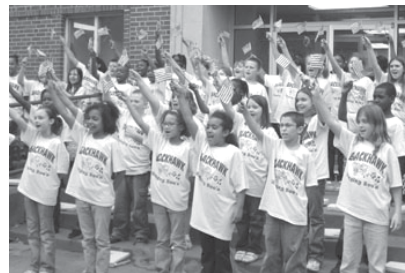
Blackhawk Elementary School chorus performs musical selections.

On Saturday children's activities were held from 10:30 a.m. to 3 p.m. Children enjoyed face painting, inspecting a Spring-